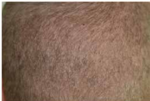
Donor area 14 days after the treatment