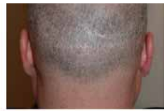
1 year postoperative