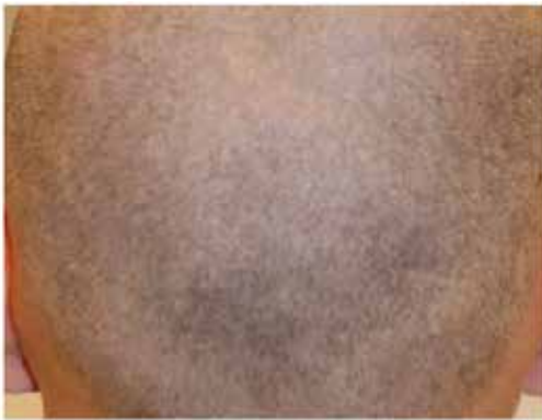
Donor area before the treatment (dark hair)

These photos show that after a period of 10 days, nothing remains visible of a FUE treatment, on condition that the postoperative instructions are followed scrupulously.