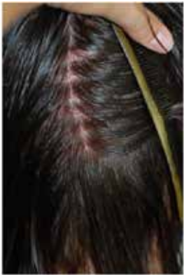
Donor area with micro strips