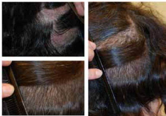
Macro strips intra-operative and 2 weeks postoperative