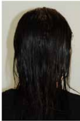
Donor area immediately postoperative

The removal of the follicular units will usually occur in 2 phases. During the first phase, a sharp punch needle ( \varnothing 0.75mm to 0.90mm) is placed over the follicular unit and a circular incision is made up to half the depth of the hair follicle, and in doing this, the angle of the follicular unit is taken into account. Next, the follicular unit is detached from the soft, surrounding skin tissue. Once the follicular unit is detached, it can be removed in a second phase using one or two tweezers. Once removed, the follicular units are prepared microscopically if necessary in order to be placed afterwards in the micro-incisions in the host area. The follicular units which are removed using the FUE technique are quite delicate anatomical structures, which are only protected by a limited quantity of connecting tissue, and therefore are more susceptible to damage. Daily routine, a very precise movement and many years of microsurgical experience are absolute requirements to obtain excellent results. Due to the great precision and years of experience of Dr. Feriduni and his medical team, 3500 to 4500 follicular units can be removed in a 2 successive day session, on condition that there is sufficient donor material available.