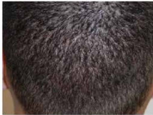
Donor area 10 days after the treatment