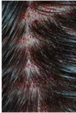
Micro strips in close-up