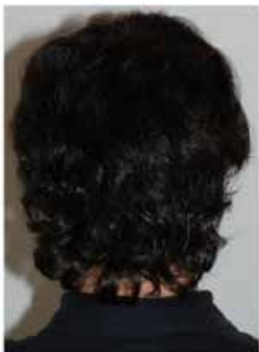
Donor area pre-operative