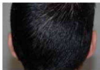
1 year postoperative