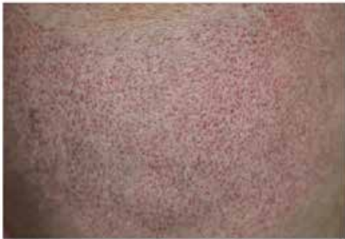
Donor area immediately after the treatment (light hair)